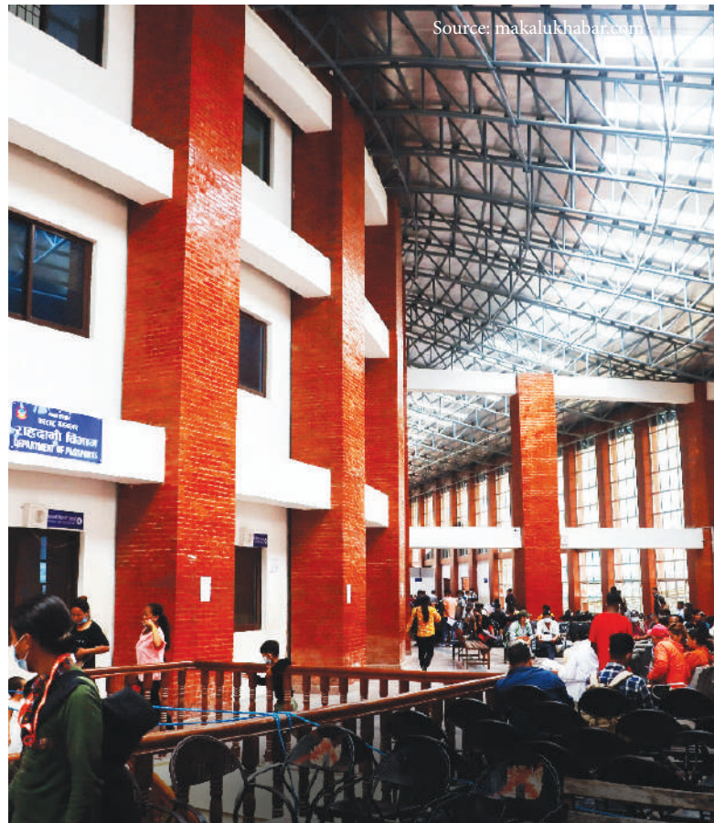
Picture: Department of Passport, Tripureshwor, Kathmandu

Proceed to the biometric room for the necessary data collection. After completing the biometrics, you will be given a voucher and your verified form.